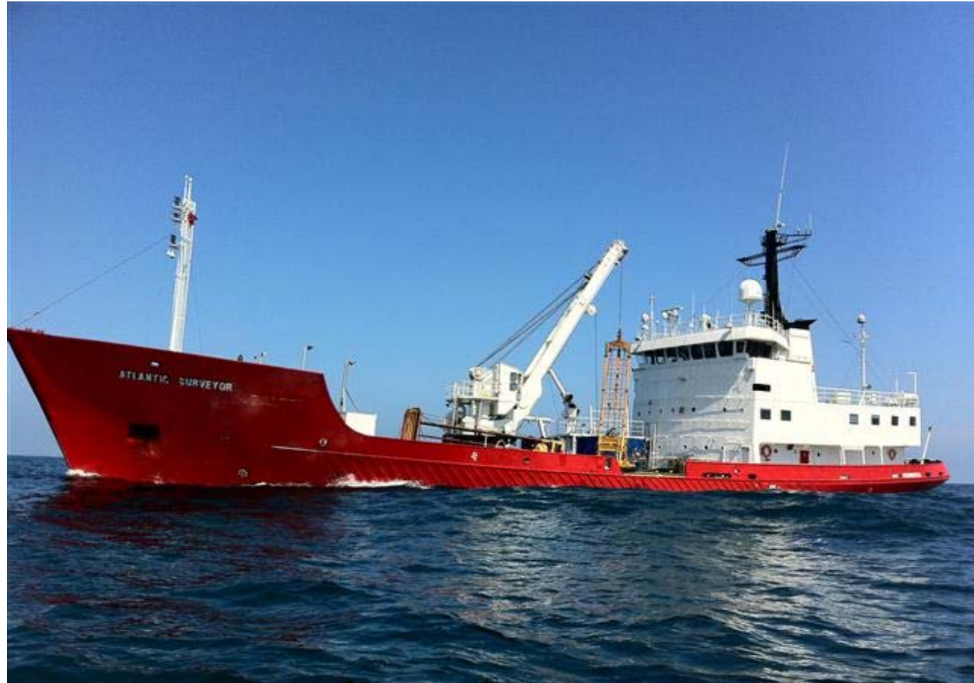
Atlantic Surveyor Multi Purpose Offshore Support & Survey Ship